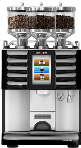
Coffee Art C HC Touch 3G Model #: 040381-00051EUS