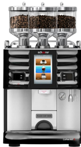
Coffee Art C HC Touch 3G Model #: 040381-00053EUS