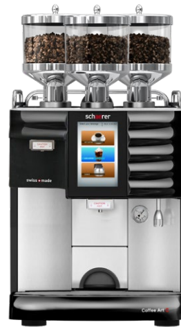
Coffee Art C HC Touch 3G – Dual Dispense 040381-00071EUS