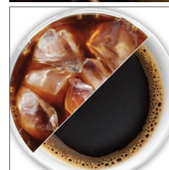
Dispense Hot and Iced Coffee